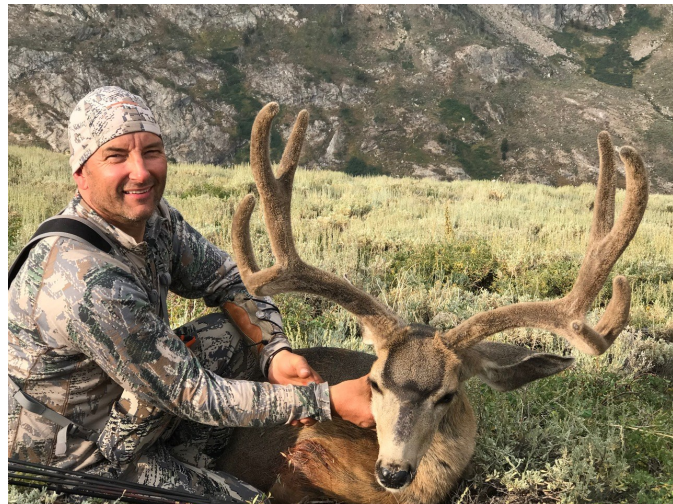
South Cox's NV Buck