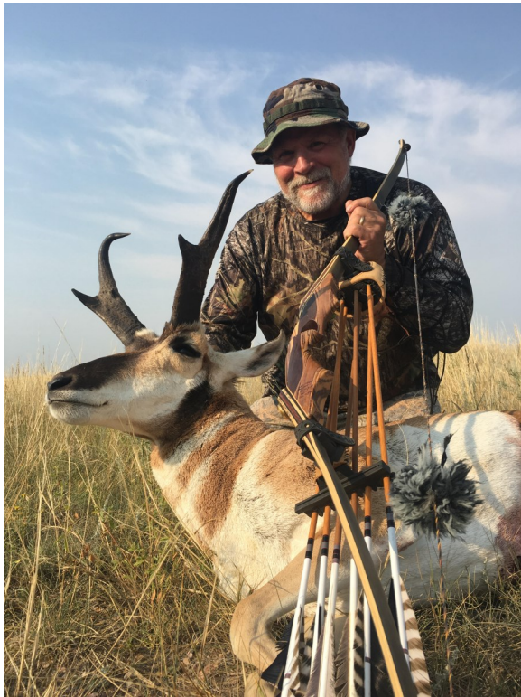
Pronghorn