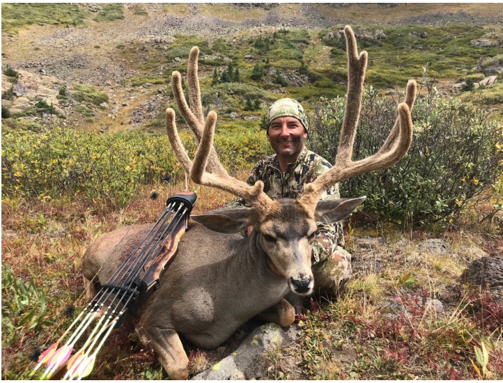
South Cox's CO Buck