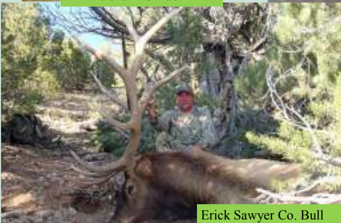
Erick Sawyer Co. Bull