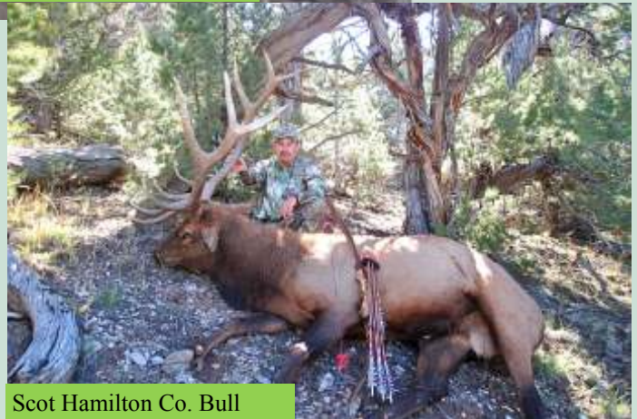
Scot Hamilton Co. Bull