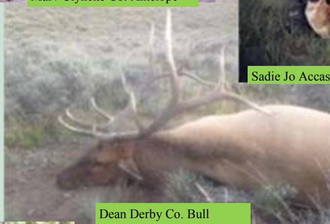
Dean Derby Co. Bull