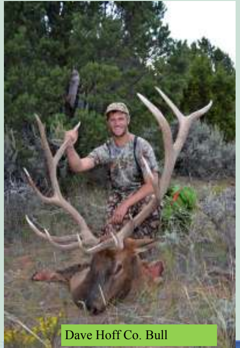
Dave Hoff Co. Bull